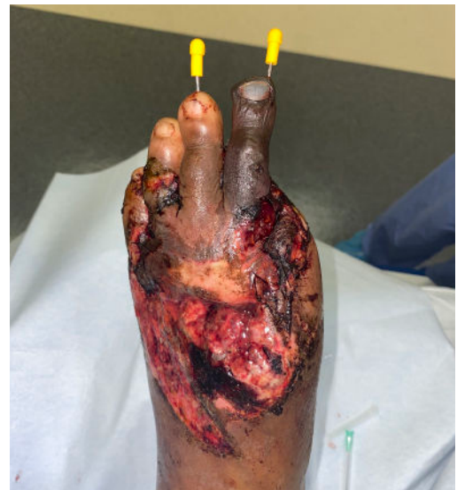
Figure 1. Initial presentation in wound facility.

Six weeks post first ray amputation, the patient presented at the Village Podiatry facility, where he complained of pain and drainage to his foot. Upon initial examination, a large necrotic wound was noted on his dorsal foot with a cyanotic second toe. (Figure 1.)