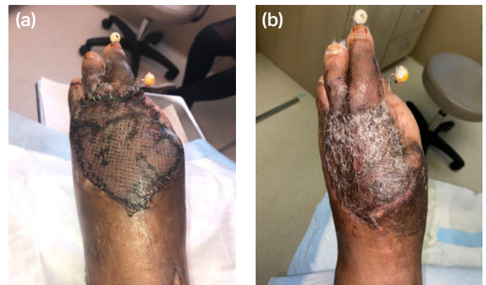
Figure 3. (a) Post STSG application. (b) At 3 week follow up with complete take of STSG.

Patient had full take of the STSG and saw complete resolution of the wound within three weeks of the STSG application. (Figure 3.)